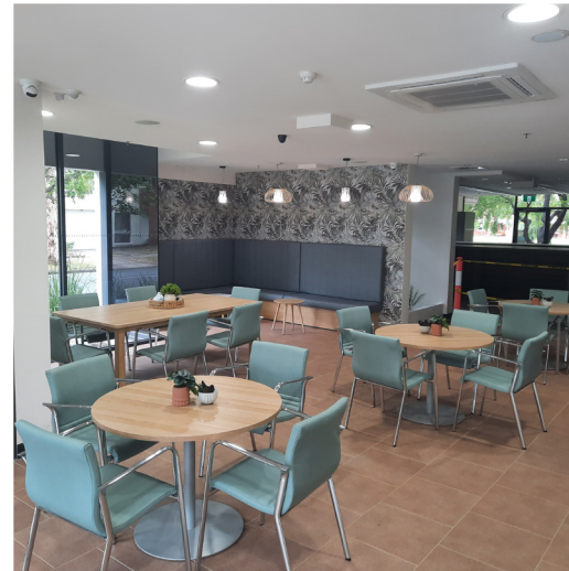
Photos are for display purposes only. They may not be indicative of the actual apartment styling