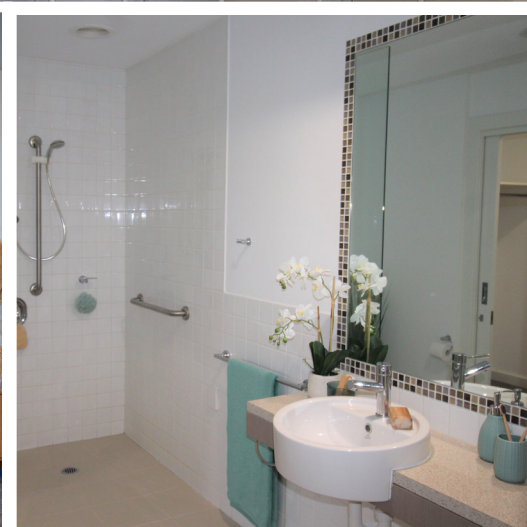
Photos are for display purposes only. They may not be indicative of the actual apartment styling