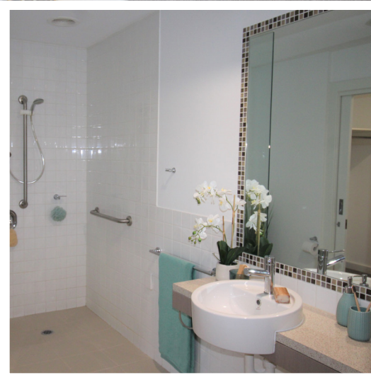
Photos are for display purposes only. They may not be indicative of the actual apartment styling