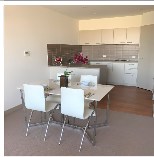
Photos are for display purposes only. They may not be indicative of the actual apartment styling